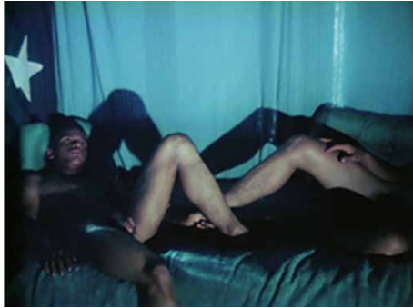
Invocation of My Demon Brother

of the Church of Satan, comes through a door in a satin cape and plastic horns to make an offering. The naked boys seen at the beginning of the film wrestle in a double exposure. (This scene may have been an instance of recycling; Anger produced for private collectors a number of erotic films not intended for theatrical exhibition.) Members of Bobby Beausoleil's band descend the stairs of the Russian Embassy with their instruments. A scene of stop-motion animation depicts a black mammy doll in a turban trailed by puffs of smoke, coming down the same set of stairs as the band and holding a handwritten sign that reads, "Zap / You're pregnant / That's witchcraft." This plays as a joke,