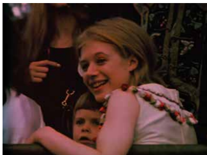
Invocation of My Demon Brother

Francisco hippies that there was no Santa Claus, i.e., that their counterculture was turning into something very different from what they thought it was (a message that fell on deaf ears), to telling a more receptive audience of English rock stars that Santa Claus really did exist, in the person of Aleister Crowley, whose