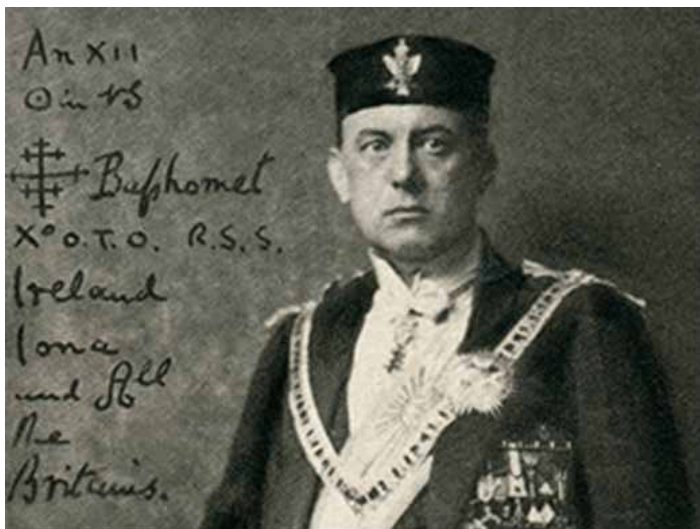
Aleister Crowley as Baphomet